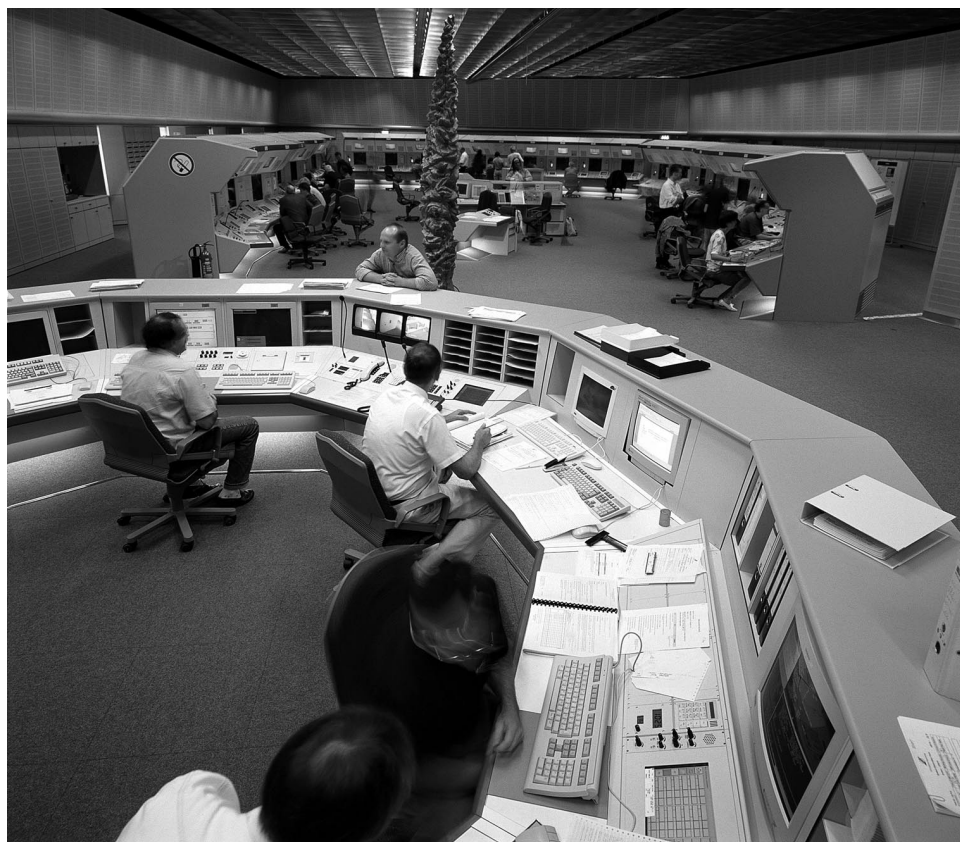
Figure 1: Langen Control Center, Langen, Germany

been able to make key strategic decisions that would have been politically difficult when DFS was under government control.