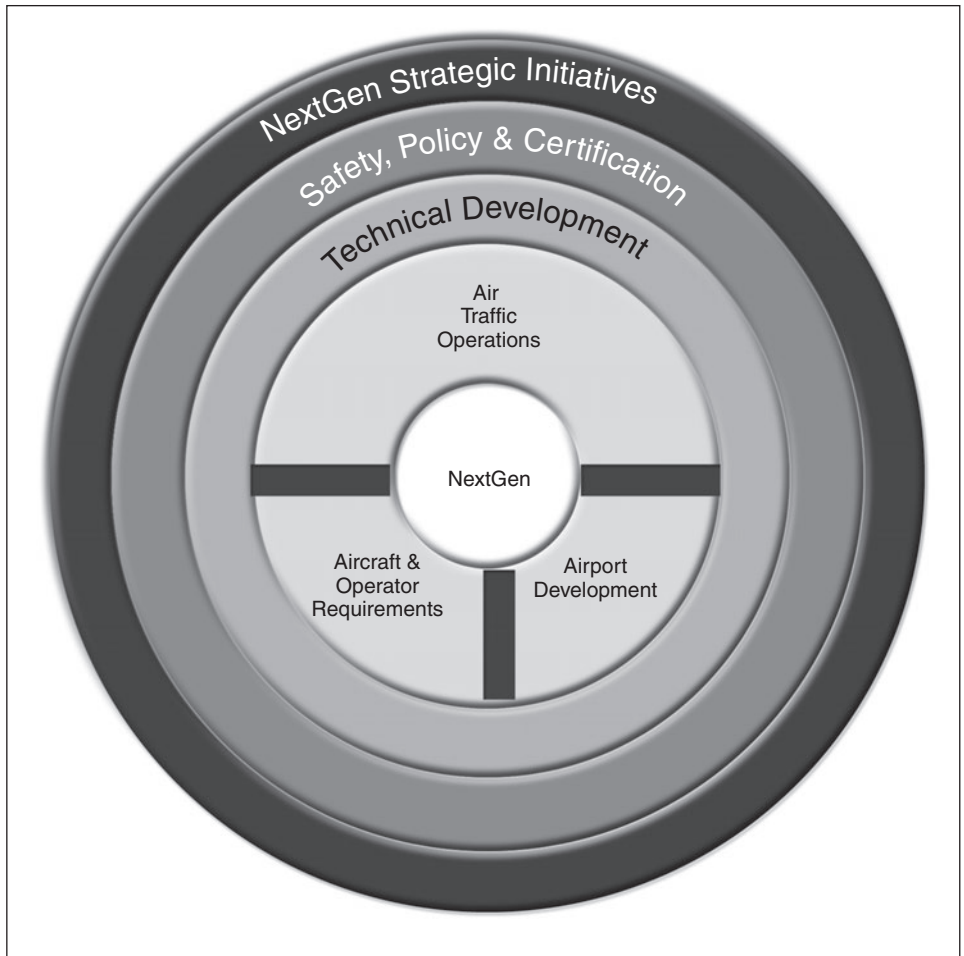
Figure 2: New OEP Framework